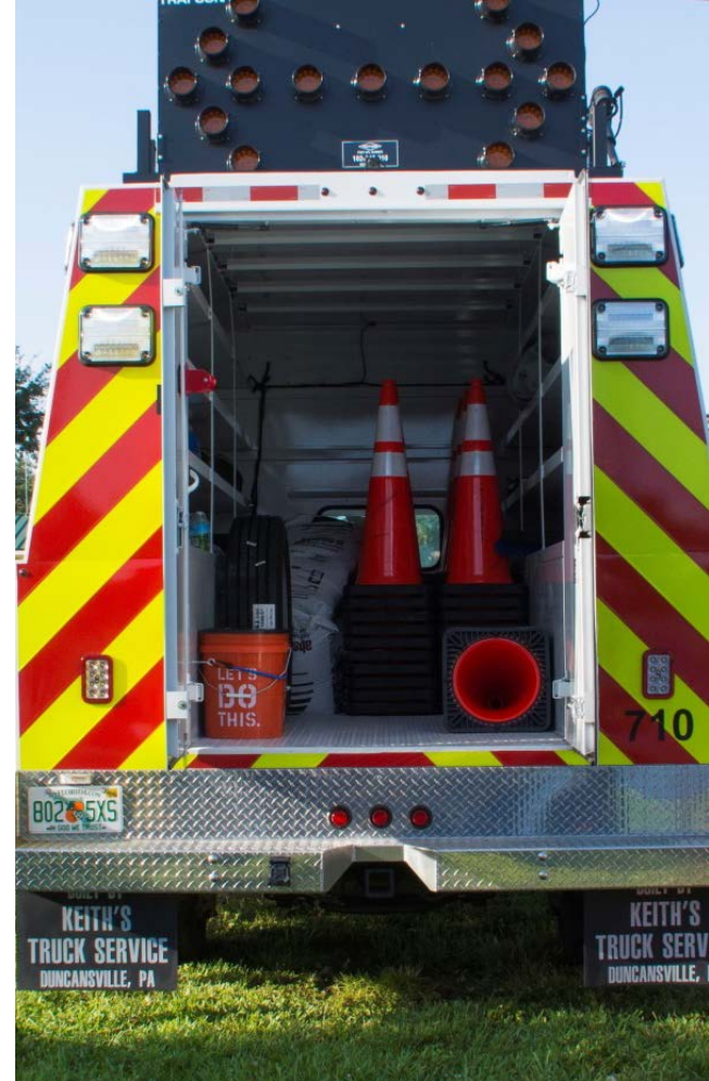
SIRV Vehicle Specialized Equipment